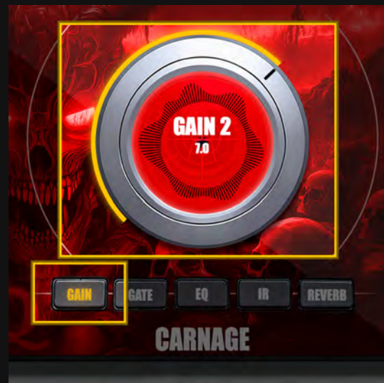
*double click to switch channels

When you click on another function, Carnage will remain on the channel selected and gain value set.