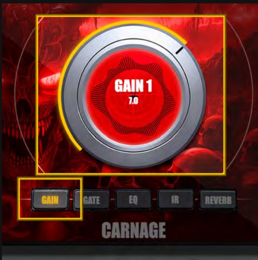
*one click controls channel

To switch between the channels, with the "Gain" button already selected, press the "Gain" selection button for a second time which will toggle you to the secondary channel.